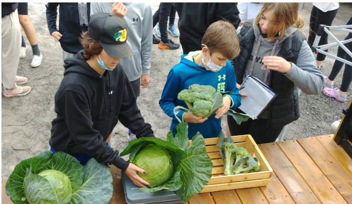
Thank you Loughborough Public School students for your help with our garden.

Thank you to everyone who supported our market, and thank you Kingston Community Credit Union and Concentra Bank for your generous $7K donation at the beginning of the garden season that allowed us to buy the materials needed that helped our garden to flourish. As well, a big thank you to our hard working volunteers and Loughborough Public School students who tend our garden throughout the season. From planning to planting to harvesting, we couldn't do it without the kindness and support of others.